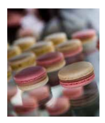
Images: Macarons by Al Strong at Elephant Yard, Farrer's Tea & Coffee Merchants, Lunch in Kendal's Yards

Discover the best local produce just out of town at Low Sizergh Barn Shop or Plumgarth's Farm Shop.