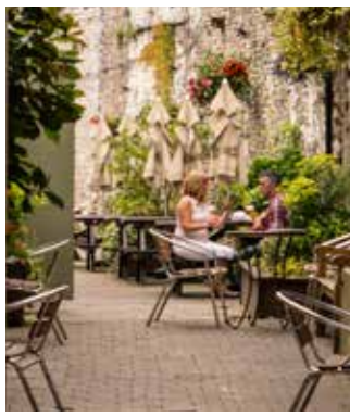
Top tips for eating and drinking

We're rightly proud of our world famous Kendal Mint Cake! A pocket essential as you take to the trails