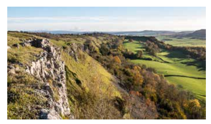
Images: Kendal Cycling Club, Kendal Mountain Festival Trail Run, Scout Scar